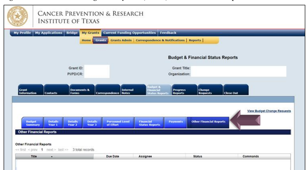
Figure 6: CPRIT Grant Management System (CGMS) "Other Financial Reports" subtab

The other financial reports must be submitted through CGMS/CARS under the "Other Financial Reports" sub-tab under "Budget & Financial Status Reports."