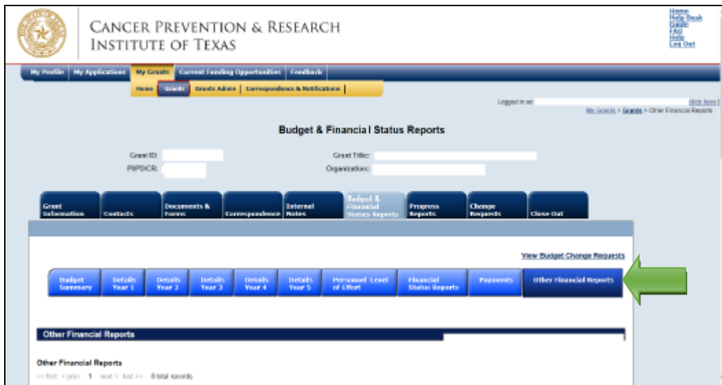
Figure 6: Other Financial Reports screenshot

The other financial reports must be submitted through CGMS/CARS under the “Other Financial Reports” sub-tab under “Budget & Financial Status Reports.”