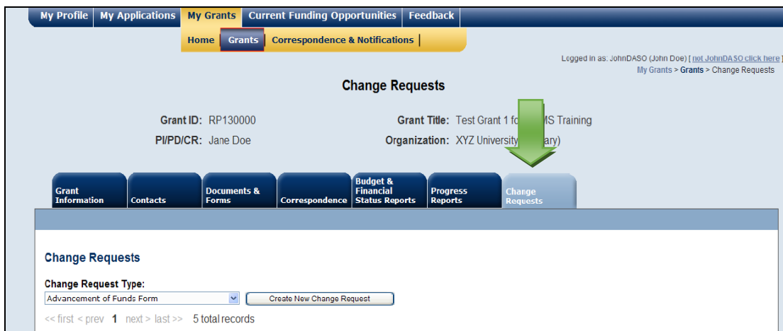
Figure 3: Contract Amendment Request Screenshot

For most contract change requests initiated by the grantee, the contract amendment is requested via the “Change Request” tab. Approval of the contract amendment request is at the discretion of CPRIT, and if approved, will be executed by the Chief Executive Officer.