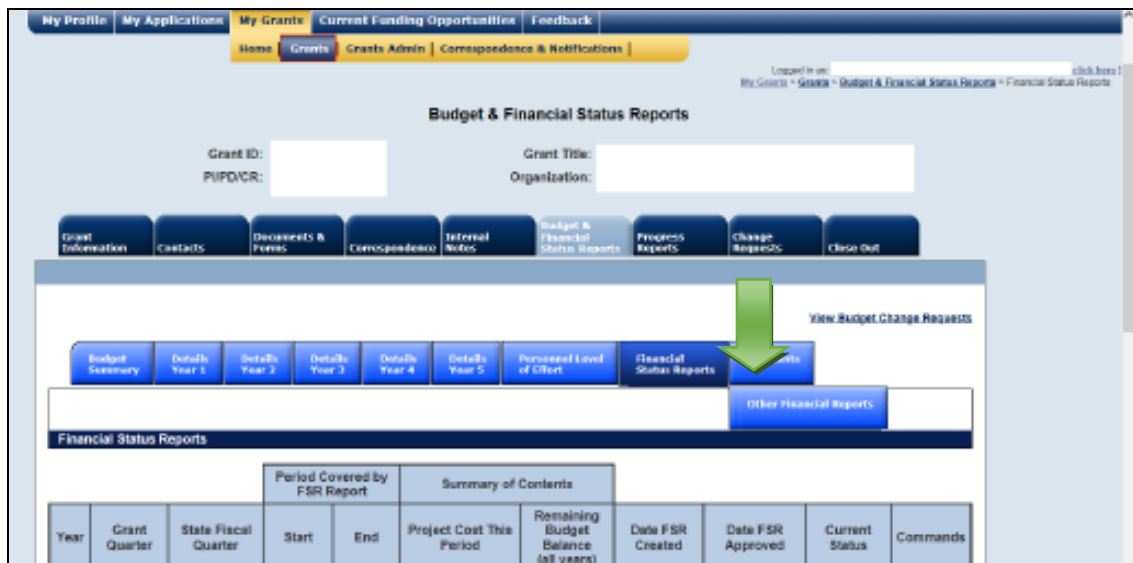
Figure 4: Budget and Financial Status Reports screenshot

FSRs must be submitted in CGMS/CARS in the “Financial Status Reports” sub-tab located under the “Budget & Financial Status Reports” tab.