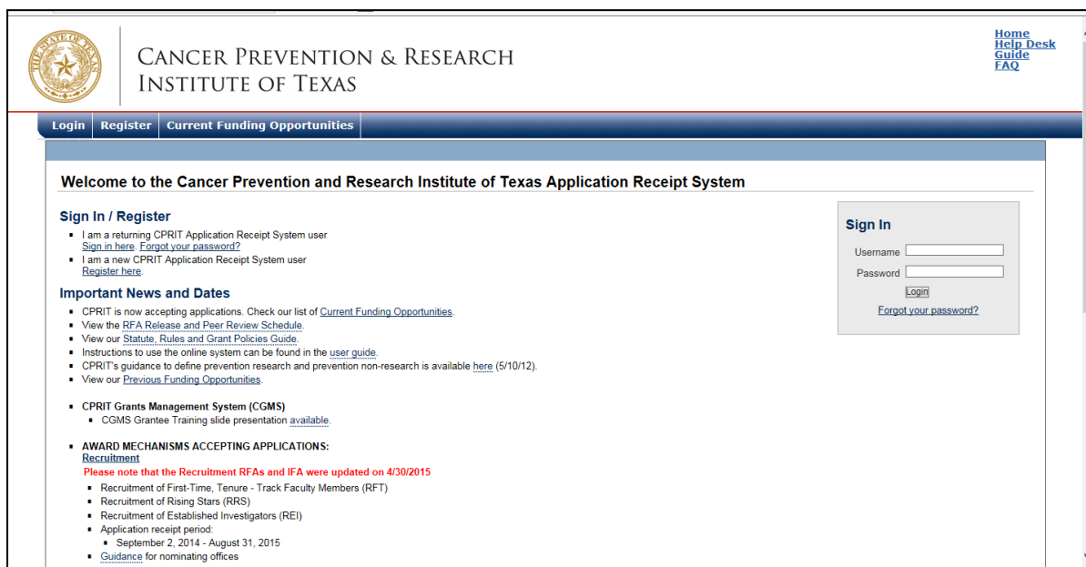
Figure 2: CPRIT's Grant Management System screenshot